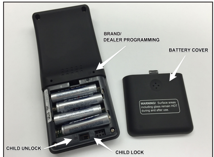
Figure 1. Install Batteries & Child Safety